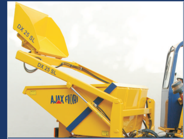
Hydraulic powered self loading