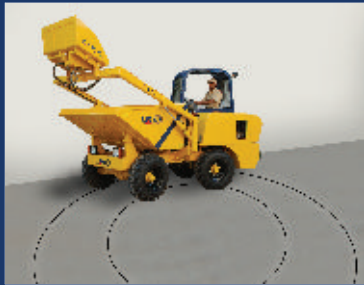
Short turning radius: 4.2 meters