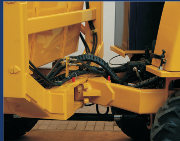
Articulation angle : 30 degrees